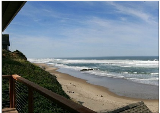
Lincoln City, Oregon